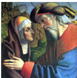
Sts. Joachim & Anne, Parents of Our Lady Feast Day July 26th

merchandise, visit the DeColores Rainbow Store at www.decolores.com . It comes highly recommended for their prices, inventory and service!